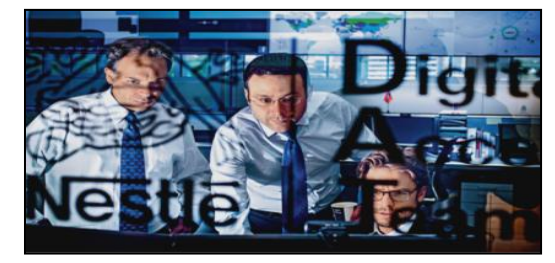
Digital, IT & Technology